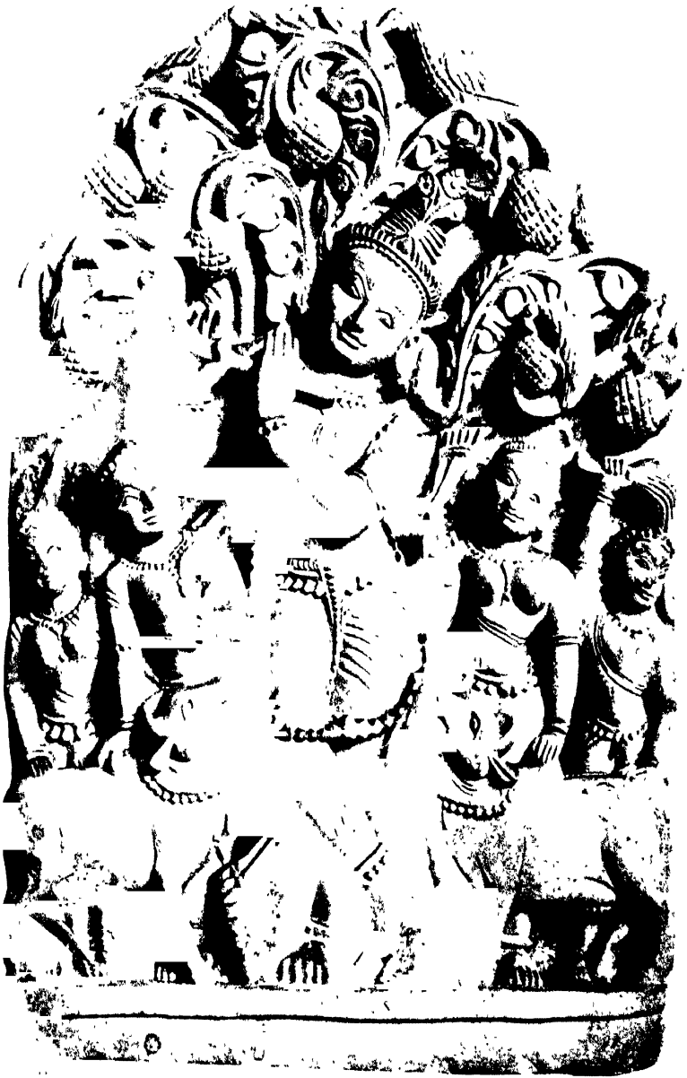
KRISHNA AND THE GOPIS HERDSMAIDS