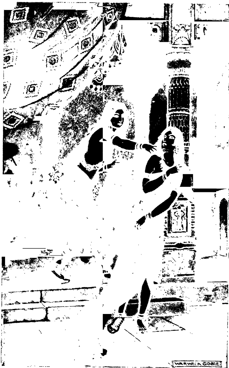
THE ORDEAL OF QUEEN DRAUPADI