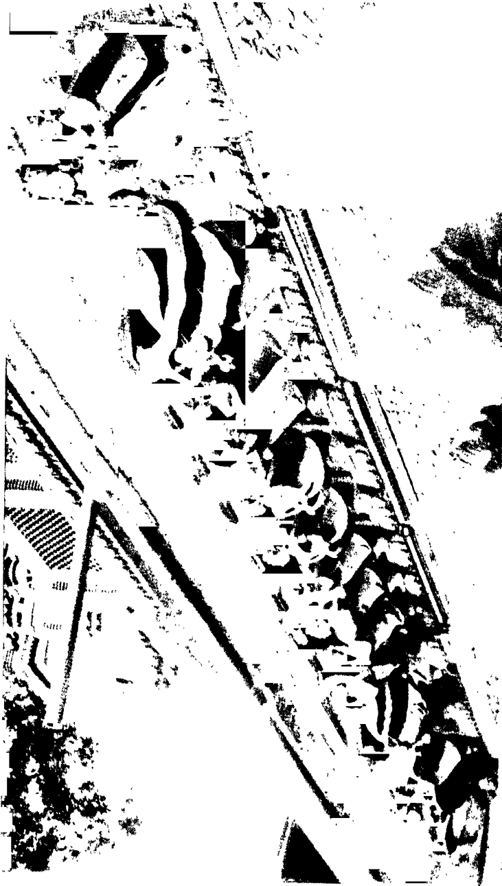
THE CELESTIAL FAIRIES (APSARAS)