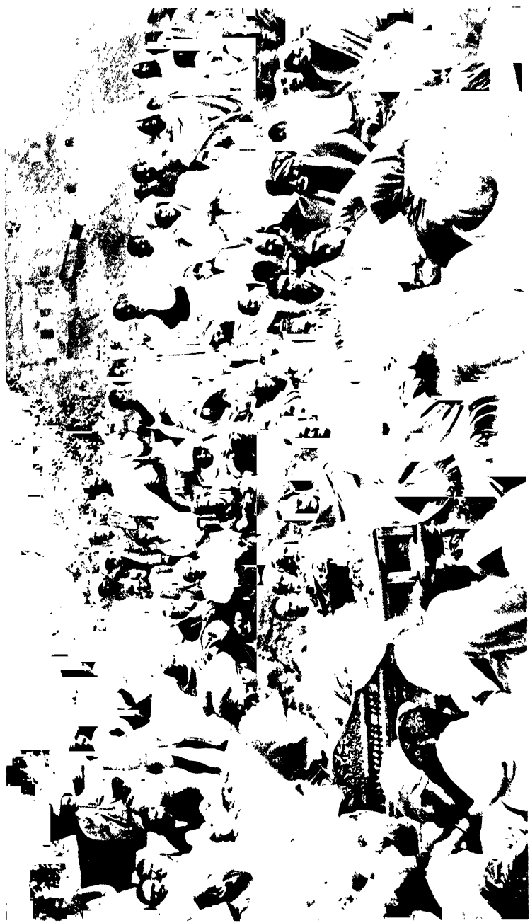
A VVASA OR PUBLIC READER, RECITING THE MAHABHARATA