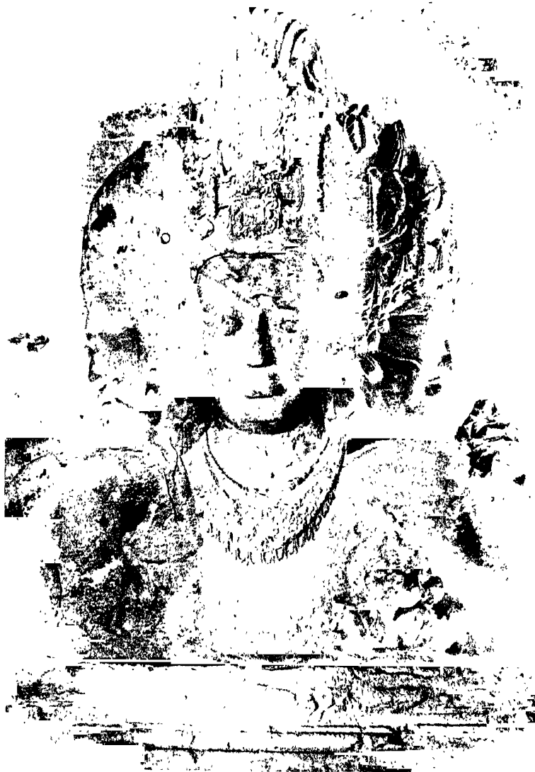
THE HINDU TRINITY AT ELEPHANTA (see page 110)