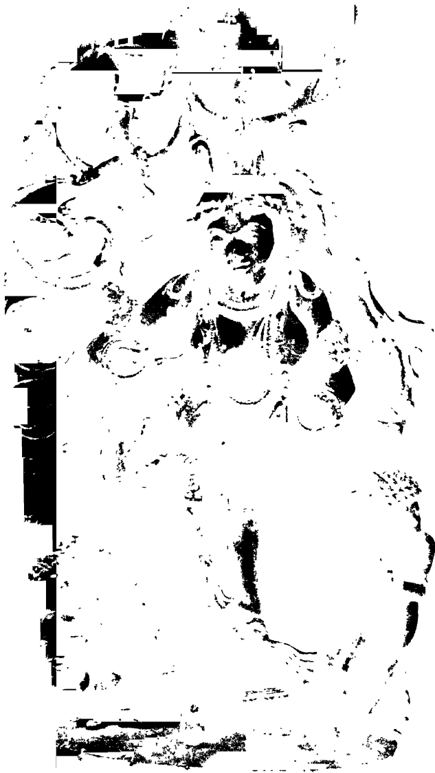
PARVATI, WIFE OF SHIVA (see page