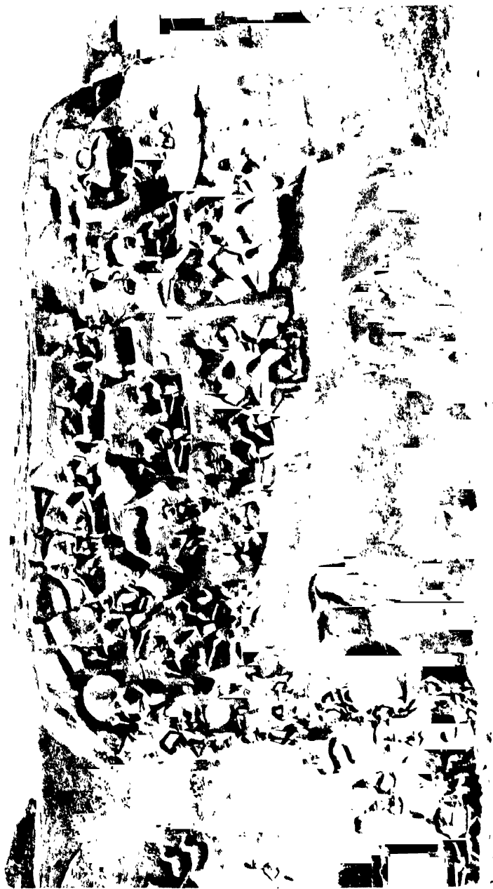
THE PARADISE OF INDRA