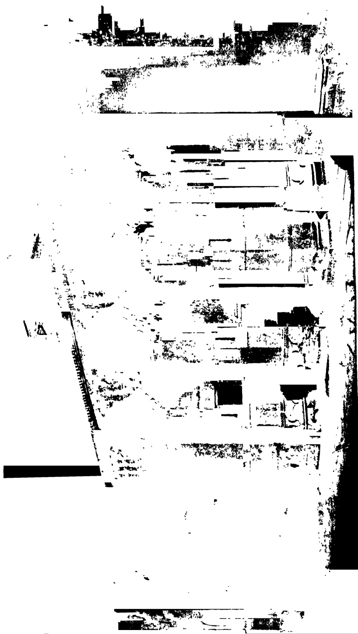
INTERIOR OF A TEMPLE TO VISNU BRINDAVAN