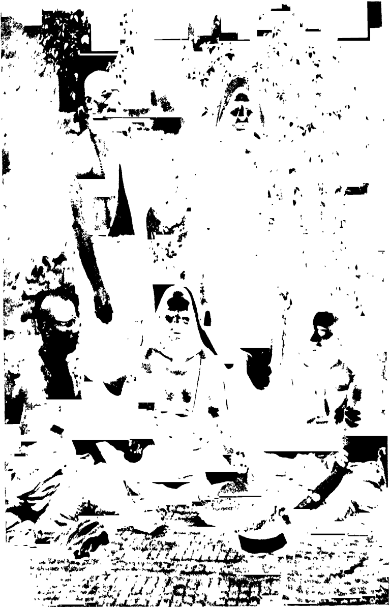
GROUP OF PRESENT-DAY BRAHMINS