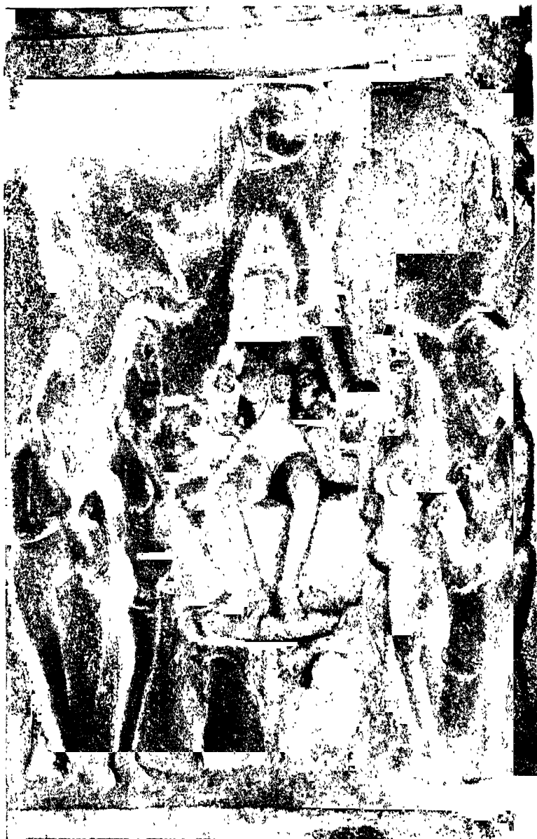
LAKSHMI ARISING FROM THE SEA OF MILK