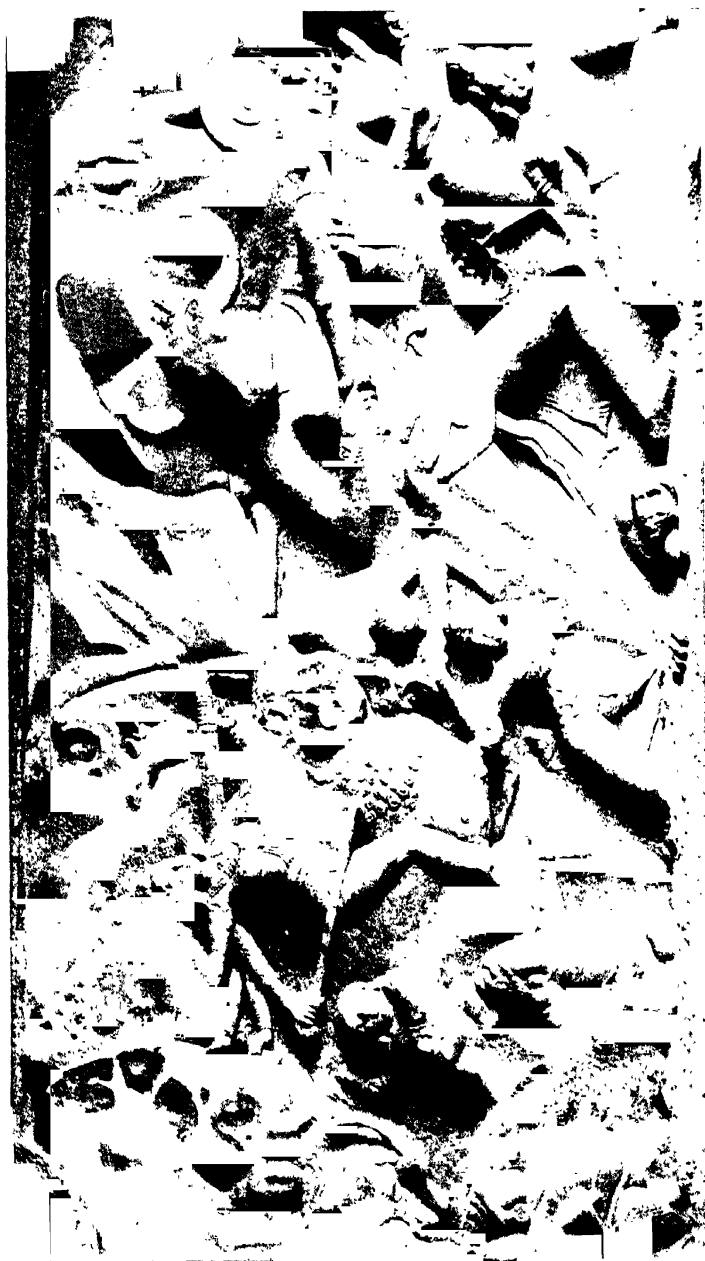
DURGA SLAYING GIANTS AND DEMONS