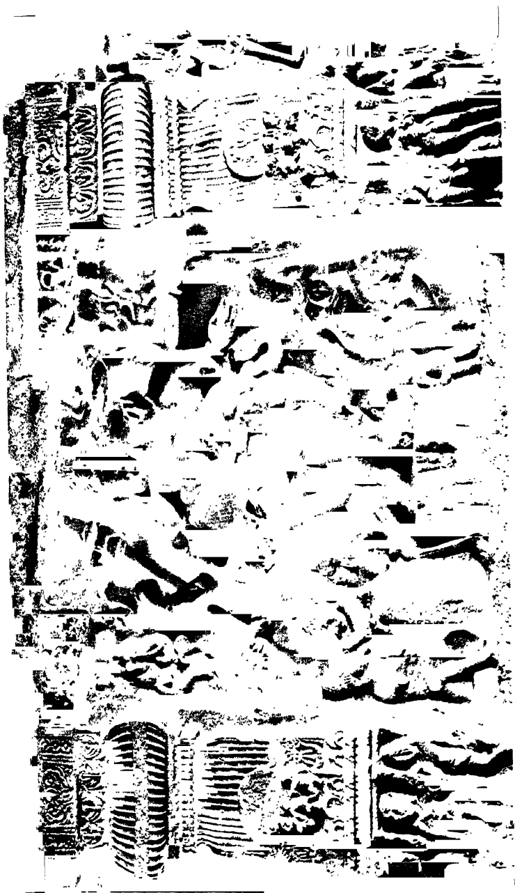
SHIVA'S DANCE OF DESTRUCTION, ELLORA (see pages 147-8)