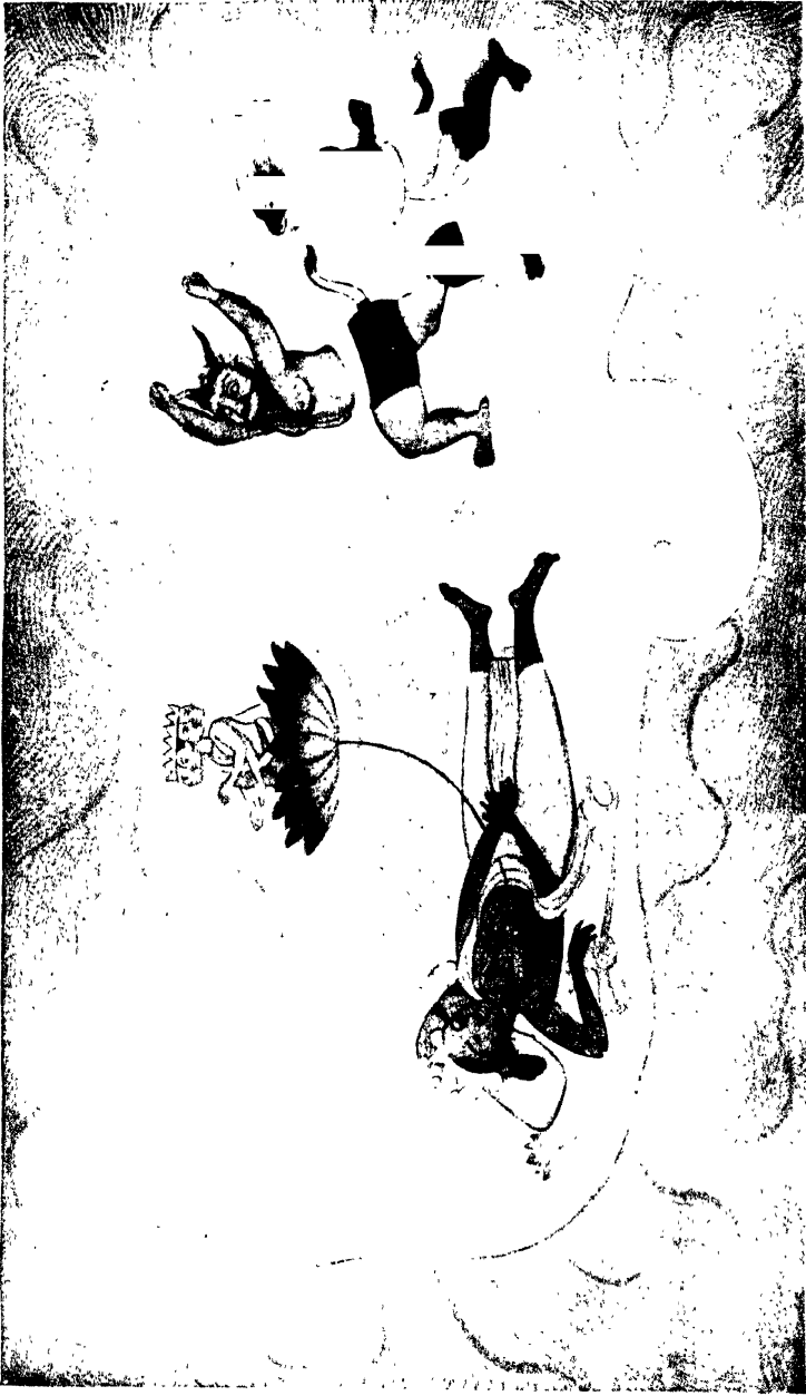
THE BIRTH OF BEAHMA - SPRINGING FROM A LOTUS ISSUING FROM VISINI - 192 124