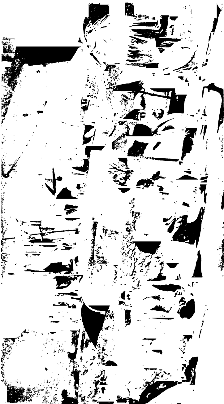
SADHUS RELIGIOUS MENDICANTS AT BENARES