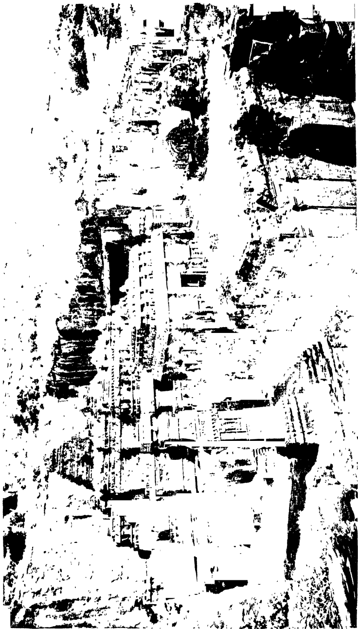
THE KAILASA TEMPLE OF SHIVA - ELLORA