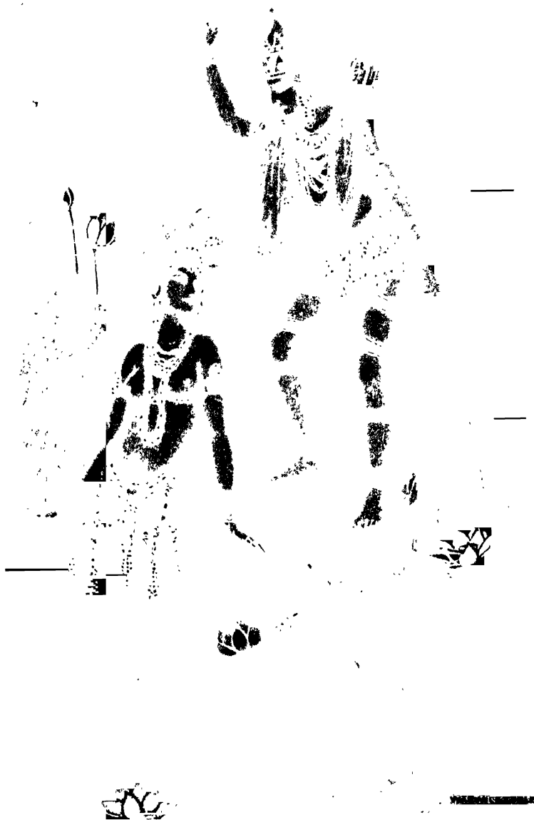
ARJUNA AND THE RIVER NYMPH