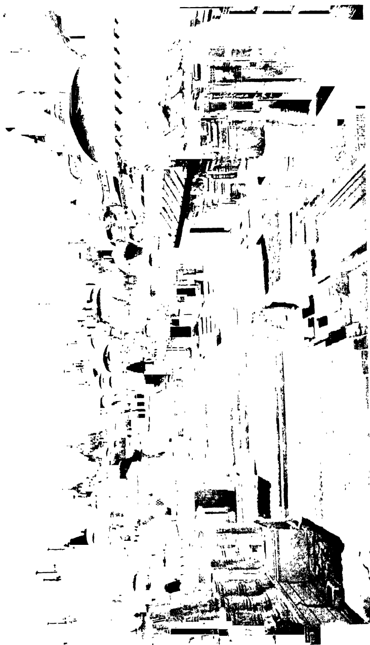
THE CITY OF THE GODS, PALLEANA