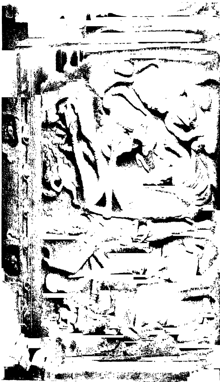
VISHNU UPHOLDING THE UNIVERSE