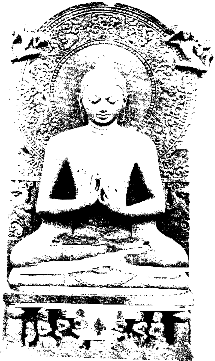
BUDDHA EXPOUNDING DUTTA