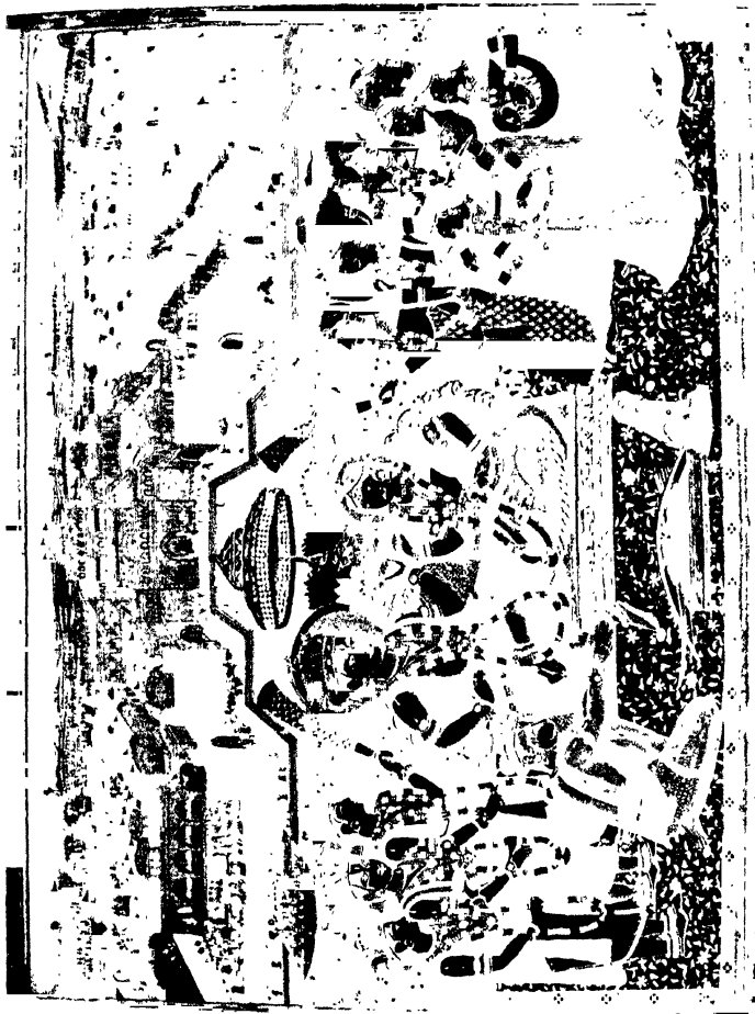
THE CORONATION OF RAMA AND SITA