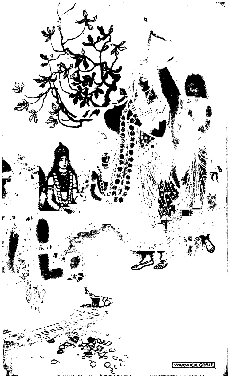
DAMAYANTI CHOOSING A HUSBAND